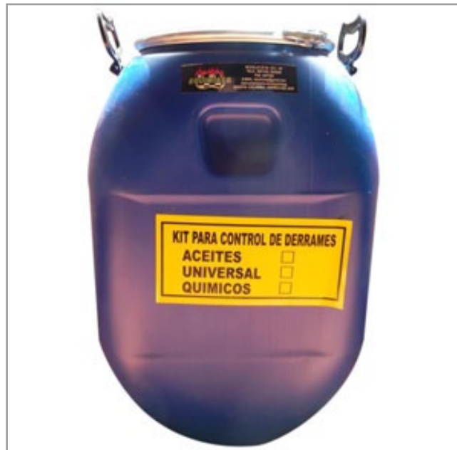
Kit para Control de Derrames