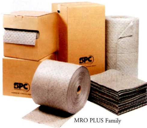
MRO PLUS Family