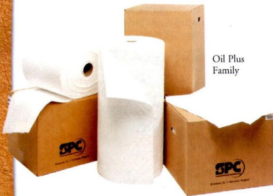
Oil Plus Family