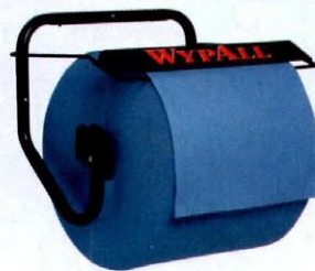
80579KC w/ 34965KC