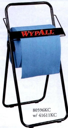
80596KC w/ 41611KC